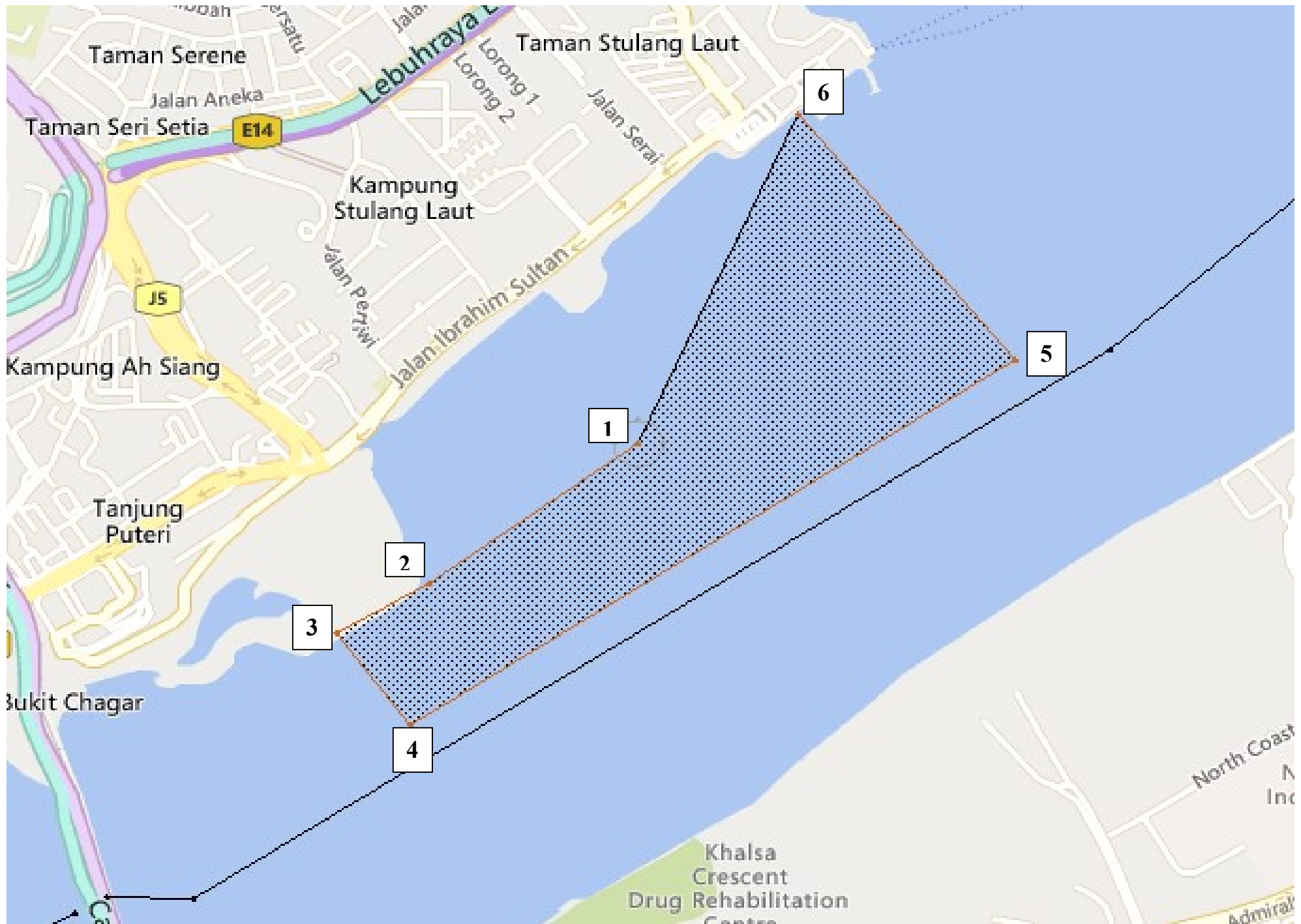
Peta 1: Lokasi aktiviti survei batimetri di Had Pelabuhan Pasir Gudang, Johor (Jabatan Laut Malaysia, 2020)